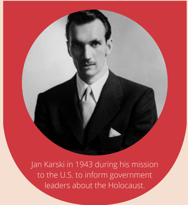
Jan Karski in 1943 during his mission to the U.S. to inform government leaders about the Holocaust.