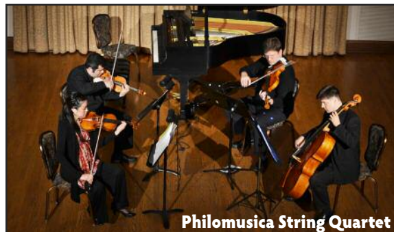
Philomusica String Quartet