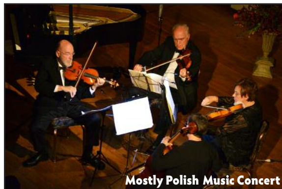
Mostly Polish Music Concert